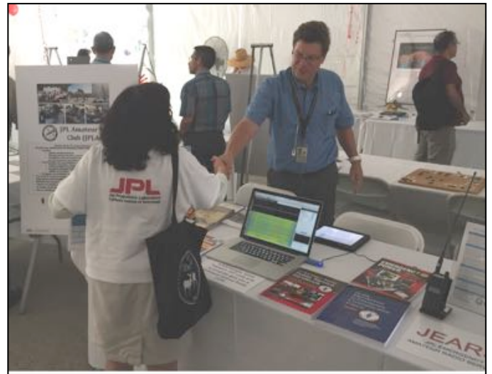
Figure 1: JPLARC/JEARS Interest Fair table